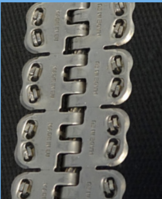
Mini Record Fastener - Bottom plate