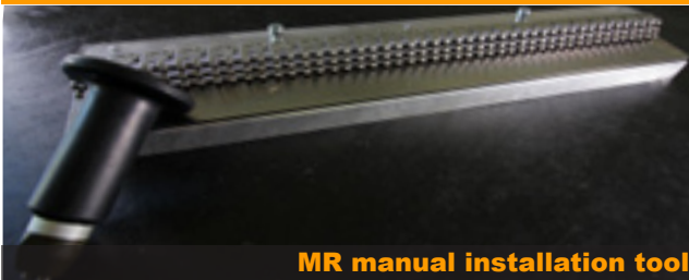
MR manual installation tool