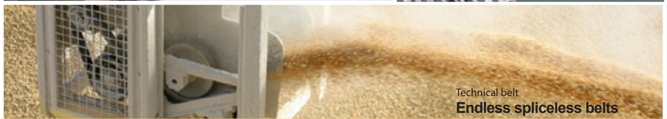
Technical belt Endless spliceless belts