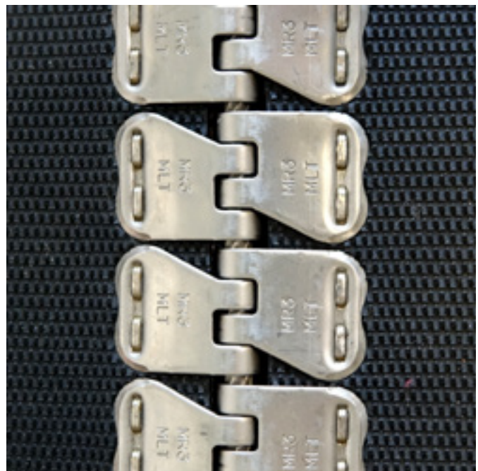
Mini Record Fastener - Top plate