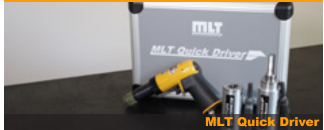
MLT Quick Driver